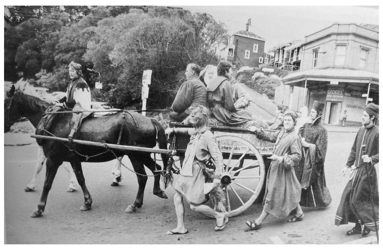
Mercury actors advertising The Canterbury Tales in Queen Street, 1971, Nicholas Tarling, Wit, Eloquence and Commerce, A History of Auckland's Mercury Theatre, (Auckland: Connacht Books, 2007)

it's a great joy."<sup>21</sup> Shows were more seamless and effective when the actors could grow to understand one another's style and craft over time.